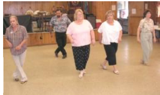
Right: A little dance known as “Lion Dancing”

BIG FROM THE MEAL) GUESTS WERE TREATED TO “LION DANCING’ BY A PROFESSIONAL “LION DANCE” INSTRUCTOR. THEY GAVE A PRESENTATION AT THE CONCLUSION OF THE EVENING. THEY EVEN LEARNED TO DO THE “ELECTRIC LION SLIDE” DANCE.